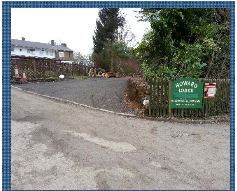
Photo of new temp access road & parking area to the front of Howard Lodge

We will keep everyone informed weeks before we plan to close the Beacon Hill carpark. Should you have any concerns or questions relating to the new building works or the ongoing operation of Howard Lodge please contact Sean. Copy of building plans attached to this newsletter if not contact Sean