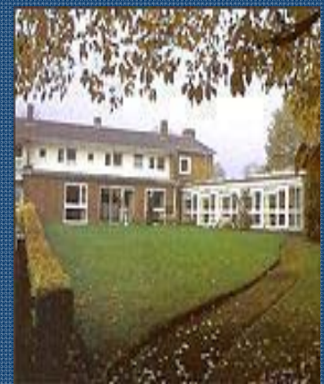
Howard Lodge Front Entrance